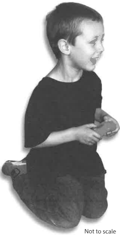
Not to scale