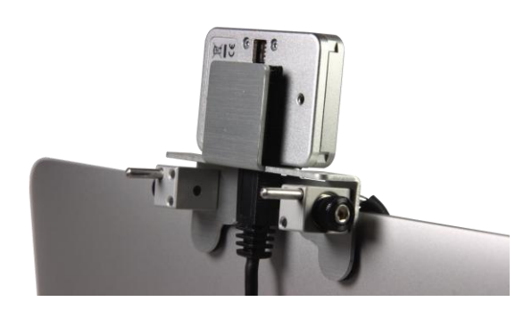
Figure 5: HeadMouse Nano with universal bracket.

The universal bracket is designed to attach the HeadMouse Nano securely to a variety of device displays – desktop, laptop, tablet and communication devices. The adjustable bracket can