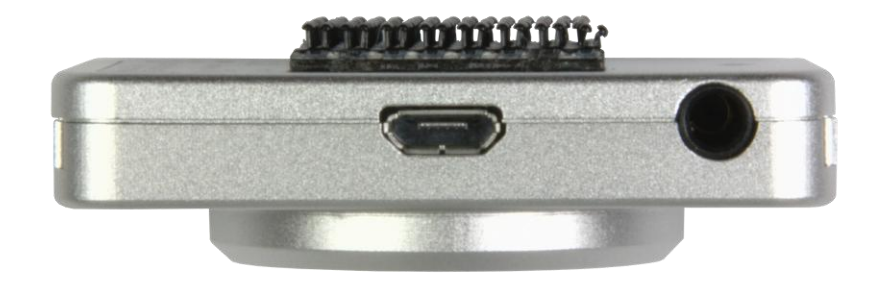
Figure 2: HeadMouse Nano Top View. USB Micro-B in the middle, and 3.5-mm jack for one or two adaptive switches.

Located on the top edge of the HeadMouse Nano are a Micro-B USB connector and a 3.5mm (1/8-inch) stereo microphone connector. Connect a mono adaptive switch into the microphone connector to provide a LEFT mouse button click. A dual-mono-to-stereo adapter is available if you need to directly connect mono adaptive switches for both LEFT and RIGHT mouse button clicks.