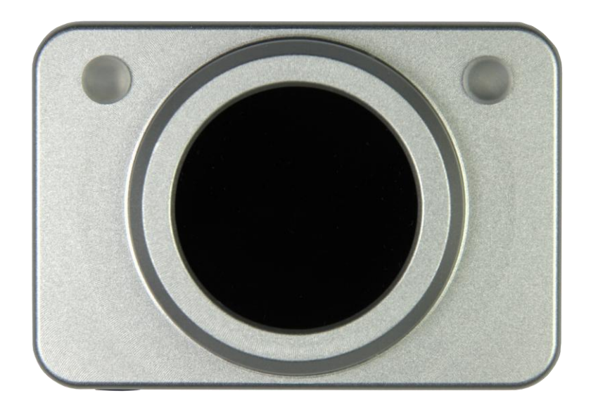
Figure 1: HeadMouse Nano Front Panel. Optical tracking sensor in the middle, infrared receiver for available Beam on the left and status LED on the right.

The aluminum body of the HeadMouse Nano measures 2.1- by 1.5- by 0.35-inches, the optical transceiver extends another 0.15-inches. For best results and reliable long-term operation, do not touch the dark window. It is not necessary to clean the window as part of a regular maintenance program.