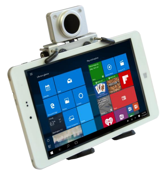
Figure 7: HeadMouse Nano on an 8-inch Tablet

A front mount style backet is available that uses two rotating and rubber tipped arms that clamp the display to its padded front tab. Simply squeeze the display between each arm and front tab while tightening the thumb nut. The arms may be rotated in, as shown in the figure, or rotated out.