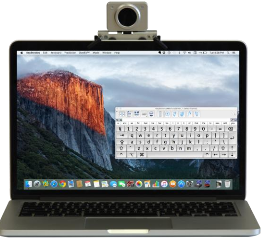
Figure 6: HeadMouse Nano with universal bracket on a laptop computer

After attaching the mounting bracket to your device, simply snap the HeadMouse in place.