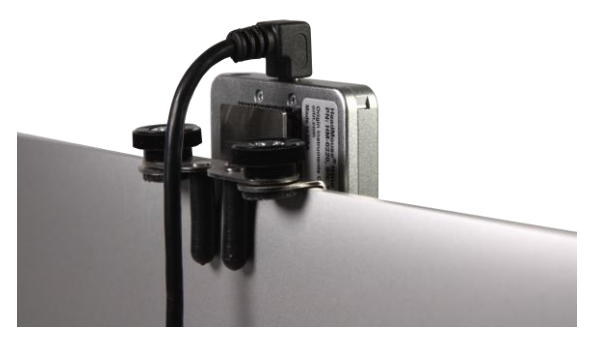
Figure 8: Front mount bracket style

A front mount style backet is available that uses two rotating and rubber tipped arms that clamp the display to its padded front tab. Simply squeeze the display between each arm and front tab while tightening the thumb nut. The arms may be rotated in, as shown in the figure, or rotated out.